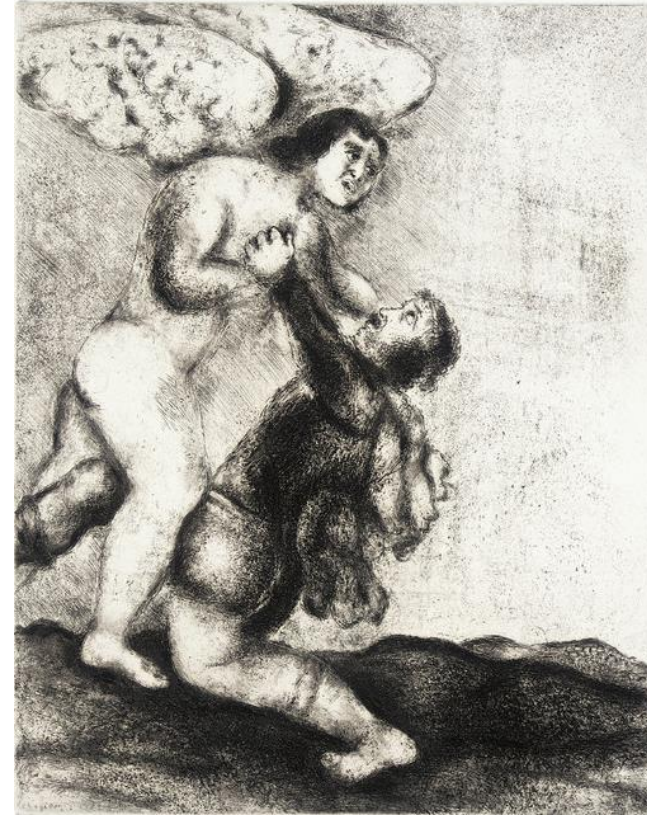
Marc Chagall, Jacob Wrestling with the Angel, 1931-1956, LA County Museum of Art Collection